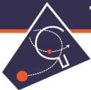
TABLE TENNIS AUSTRALIA Ltd.