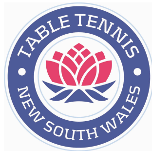
TABLE TENNIS NSW INC.